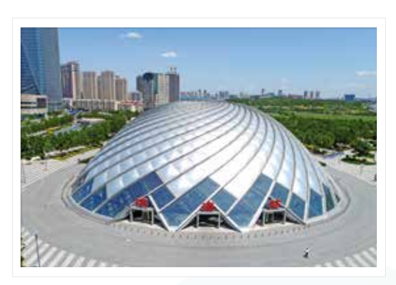
滨海站站房外正立面 The facade of the station building of Binhai Station

2019年,公司获得的国家级工程质量奖数量创历史最好成绩,有7项工程获国优金质奖,在建筑央企中排名第一;有10项工程获中国建设工程鲁班奖;57项工程获国家优质工程奖;西成高铁和云桂铁路、鹦鹉洲长江大桥分获FIDIC (International Federation of Consulting Engineers, FIDIC) 杰出项目奖与优秀项目奖,中国中铁是本届FIDIC奖评选全球获奖最多的企业。