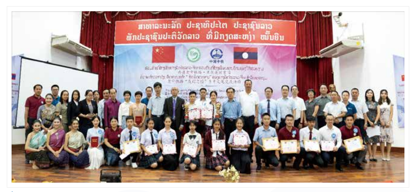
中老铁路"友谊之桥"青年文化交流活动 China-Laos Railway "Bridge of Friendship" Youth Cultural Exchange Activity

CREC actively promoted territorial management with a focus on integration with local people. Through the organization of a series of activities such as the "Chinese Culture Colloquium" by the Confucius Institute jointly with universities of host countries, CREC fully played the role of bridging, influencing and leading cultures, told the world a good Chinese story, promoted the "going out" of excellent culture, and contributed to the connection of hearts and minds of the people along the "Belt and Road".