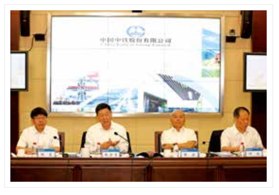
2019年中期业绩推介会 2019 Interim Results Presentation

公司始终注重实现董事会成员多元化,以提升董事 会决策效率和企业管治水平。根据沪港两地上市规 则和监管规定,公司制定了《董事会成员多元化政 策》,并遵照执行。公司董事会现任8名董事,其中 3名执行董事具有丰富的建筑行业从业及管理经验, 5名外部董事分别在电力行业、有色金属行业、银 行金融业等领域有着丰富的从业及管理经验,董事 会成员的设置与组成符合多元化政策要求,也满足 企业发展需要。在董事会成员多元化背景下,公司 董事会积极构建民主议事氛围,严格落实议案票决 制,充分发挥董事会成员结构多元化的优势,保障 每位董事能够积极利用各自丰富的专业知识和管理 经验参与公司治理,并对重大事项独立发表意见、 进行决策, 使董事会决策能够更加全面的关注公司 发展,使公司能够更加客观的制定战略、研究问 题、防控风险,为提高公司治理水平,提高董事会 决策科学性和有效性, 维护公司整体利益和全体股 东的合法权益, 特别是保护中小股东利益发挥了重 要作用。