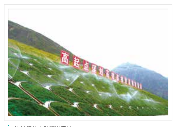
边坡绿化自动喷淋系统 An automatic spraying system for side slope greening

The Company has integrated the concept of green development into its business, and remains keenly aware of relevant opportunities. Through systematic identification, the Company spares no effort in green planning and construction, clean energy development and environmental protection industry construction, contributing to the construction of ecological civilization.