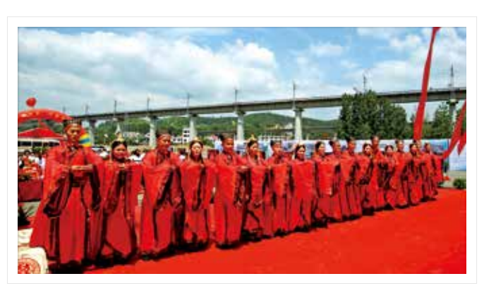
中铁上海工程局为蒙华铁路项目10对新人举办汉式集体婚 CREC Shanghai Engineering Bureau held a Chinese-style group wedding ceremony for 10 couples from the Western Inner Mongolia-Central China Railway Project