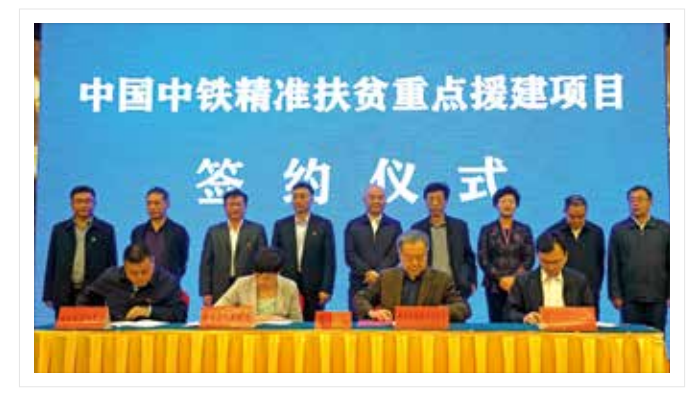
中国中铁精准扶贫重点援建项目签约仪式 The signing ceremony for the key targeted poverty alleviation reconstruction assistance project of China Railway

六是研发"精准扶贫就业管理信息系统",畅通就业渠道。中国中铁投入专项经费研发了"精准扶贫就业管理信息系统",有效对接保德、汝城、桂东三个定点扶贫县贫困劳动力就业工作。目前,"就业信息平台"已在保德、汝城、桂东三县初步调试到位,并在中国中铁部分单位推广上线,求职人员信息和就业岗位信息已陆续输入,系统内在册人员10,086人,企业已发布可对接岗位437个,实现了企业用工和贫困户就业线上双选。