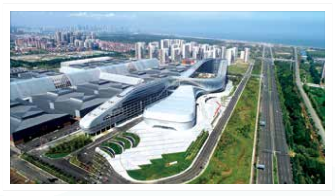
中铁青岛世界博览城会议中心综合体项目侧视图 A side view of the China Railway Qingdao World Expo City Convention Center complex project

In 2019, the number of national-level engineering quality awards won by the Company was the best in history, and 7 projects won the National Excellent Gold Award, ranking first among central enterprises in construction industry; 10 projects were awarded Luban Prize for China Architecture Project; 57 projects were awarded the National Quality Engineering Award; the Xi'an-Chengdu High-Speed Railway, Yunan-Guizhou Railway, and Yingwuzhou Yangtze River Bridge won the International Federation of Consulting Engineers (FIDIC) Outstanding Project Award and Award of Merit. CREC is the globally most awarded company in this FIDIC Award.