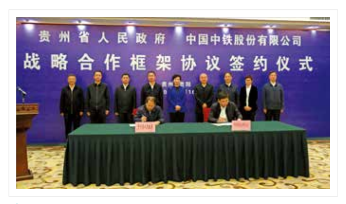
与贵州省签署战略合作协议 A strategic partnership agreement was signed with Guizhou Province