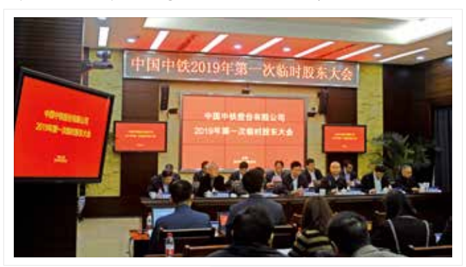
· 2019年第一次临时股东大会 2019 First Extraordinary General Meeting