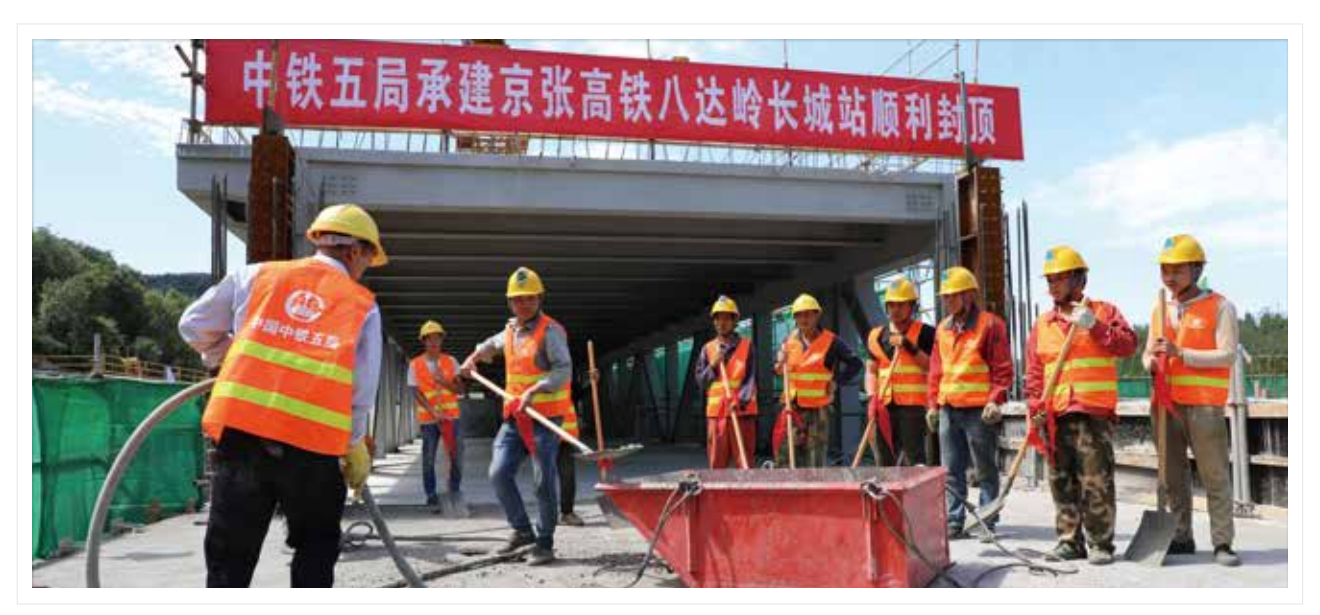
∴ 八达岭长城站封顶 Capping of the Badaling Great Wall Station

The Company continuously improves the project safety education and training system, continuously promotes the application of safety education training micro-classes, compiles and supplements quality common disease prevention courseware, and uses multimedia safety training toolbox to train field operators to realize the fun, informatization, systematization and standardization as well as diversification and specialization of training. In 2019, the Company used the multimedia security training toolbox to organize training for a total of 348,000 people, totaling 1.835 million class hours. The units affiliated to the Company continued to carry out safety and quality education and training activities at various levels. A total of 107,000 training sessions were conducted throughout the year, and 1.924 million people were trained, improving the safety quality of all employees. In 2019, the Company co-sponsored the "CREC – CUEB's Safety Production Senior Management Seminar" at the Capital University of Economics and Business. A total of 66 senior management from various units of the Company participated in the training. In addition, we held 11 training courses including continuing education and assessment counseling for registered safety engineers, and renewal assessment of the "three categories of personnel" in safety production. A total of 1,565 people participated in the training, which effectively improved the comprehensive ability of trainees.