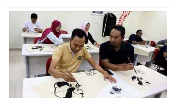
中华文化大讲堂活动 Chinese Culture Colloquium Activity

In 2019, CREC No.1 Malaysian Company together with the Confucius Institute at the University of Malaya and the Universiti Putra Malaysia hosted the second "Chinese Culture Colloquium". More than 50 persons including Chinese and foreign employees of the Company as well as teachers and students from the Universiti Putra Malaysia participated in the occasion. Activities included three segments, i.e., learning Chinese painting, shuttlecock competition, and experience of apparels from the Han Dynasty, allowing students to have a comprehensive experience of the charm of Chinese culture in an all-round way from culture to martial arts and from peace to dynamic.