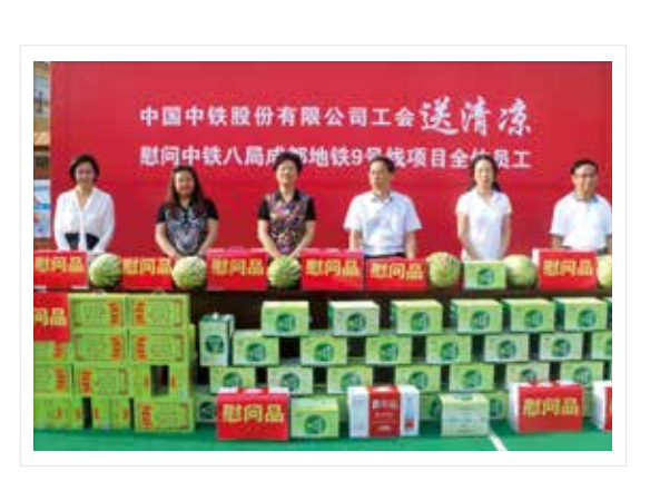
· 工地慰问 Paving a visit to a construction site

公司积极组织了一系列关爱员工身心健康活动。公 司关注工地卫生建设,持续改善施工一线的卫生水 平,为员工营造健康清洁的工作环境。公司通过 先进女职工素质提升清华大学研修班、中铁惠园 女子学堂等培训专门为女职工设置身心健康保障课 程。所属部分单位还专门为女职工增加了额外体检 项目。公司组织进行员工健康关爱书面调研、网 上问卷调查和片区督导调研,召开员工帮助计划 (Employee Assistance Program, EAP)推进视频会 和交流研讨会。公司下发《关于加强员工健康关爱 计划内部专员队伍建设的指导意见》,培训健康委 员、内训师、督导运营师、健康关爱大使志愿者550 人次,并举办EAP内训师授课观摩大赛,据统计,共 有28万人次在线观看此次比赛。公司还搭建了线上 心理自助、心理测试和心理咨询平台,开通了心理 健康知识微课堂,首次组织10万名员工线上心理健 康测评。目前全公司共建立心灵驿站1,100个,开展 心理咨询疏导活动1,228场次,电话和网络心理咨询 1,587人次,受益者达12.7万人次。