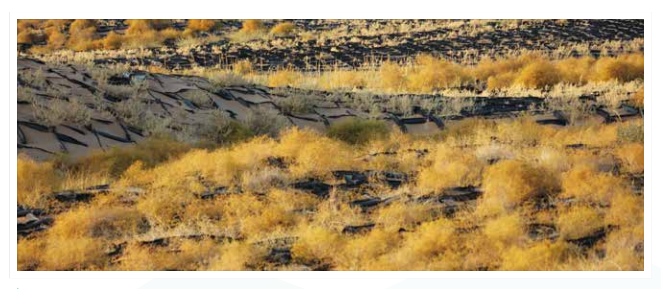
京新高速公路沿线防沙固沙成效显著 Significant success achieved in sand prevention and fixation along the Beijing-Xinjiang Expressway

The Company participated in the construction of "sponge cities" in Chizhou, Zhenjiang, Yueyang, Xuzhou, Songyuan, Rizhao and other places. It adopted technical means including permeable paving, planting roofs to achieve water absorption, storage, seepage and purification when it rained. "Releasing" and using the stored water at proper times allows cities to have good resilience in adapting to climate change and responding to natural disasters caused by rain, which can effectively alleviate the urban heat island effect and solve urban waterlogging problems.