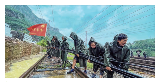
中铁七局紧急驰援太焦铁路抢险 China Railway No.7 Engineering Group Co., Ltd. rushed to restore Taijiao Railway

The Company continues to promote the construction of the emergency rescue system and strengthen the building of three national professional rescue teams. According to the overall plan for the construction of the emergency rescue system, the Company continues to promote the construction of the bases of the Kunming rescue team and the Guiyang rescue team and the upgrading and transformation of rescue equipment, and gradually expands their comprehensive emergency rescue capabilities to respond to various natural disasters. Centering on the implementation of construction projects at the bases and the new positioning and new tasks of the bases, the Company comprehensively and systematically carries out the following work: supplementing rescue personnel, improving the command system, perfecting the coordination mechanism, providing supporting infrastructure, improving rules and regulations, strengthening training exercises, and establishing a guarantee system. At the same time, the Company meaningfully strengthens the professional rescue, rapid maneuver and comprehensive guarantee capabilities of the bases.