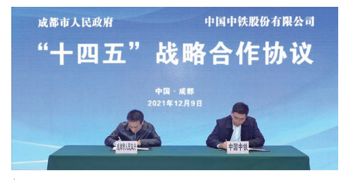
中国中铁与成都市签署"十四五"战略合作协议 CREC and the People's Government of Chengdu Municipality signed the strategic cooperation agreement for the 14th Five-Year Plan period

In 2021, by making full use of its advantages in capital, technology, management and talent, the Company conducted high-level exchanges with local governments and enterprises including the Xinjiang Uygur Autonomous Region, Heilongjiang Province, Shandong Province, Henan Province, Hubei Province, Sichuan Province, Guangdong Province, Yunnan Province, Tianjin Municipality, Chongqing Municipality, China State Railway Group Co., Ltd., China Telecom, China Mobile, China Nonferrous Metal Mining (Group) Co., Ltd. (CNMC), China International Intellectech Group Co., Ltd., China Baowu Steel Group Corporation Limited, China Datang Corporation Ltd., and China South-to-North Water Diversion Corporation Limited. This laid a good foundation for subsequent in-depth cooperation.