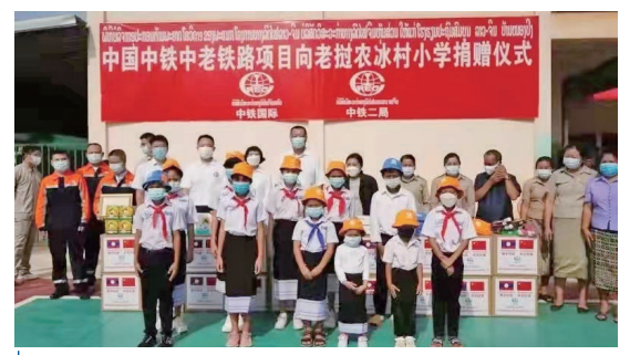
中国中铁向老挝农冰村小学捐赠文体设施和防疫用品 CREC donated cultural and sports facilities and epidemic prevention supplies to Nongbing Village Primary School in Laos

中国中铁尊重当地文化和民俗民情,注重与当地民 众融合,努力增加本土用工,关心关爱外籍员工, 秉承"授人以渔,服务全球"的文化理念,与驻在 国保持良好的文化沟通交流,广泛传播中国智慧和 优秀文化。