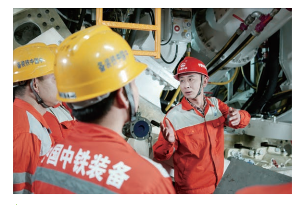
中国中铁拥有一支数量适中、结构合理的人才队伍 CREC has a talent team with adequate members and a reasonable structure

公司"双一流"高校毕业生引进力度进一步加大。 结合公司业务特点和发展需求,2021 届引进"双一 流"高校毕业生 3,434 人,占比 18.6%,较上年增长 3.6 个百分点。