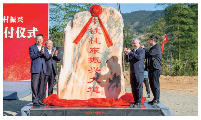
中铁桂东县振兴大道交付仪式 Delivery Ceremony of Zhenxing Avenue, Guidong County, completed by CREC