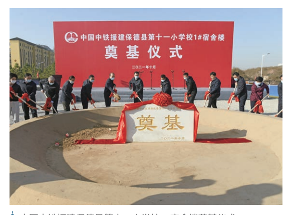
中国中铁援建保德县第十一小学校1X宿舍楼奠基仪式 Groundbreaking Ceremony for the Construction of 1X Dormitory of No. 11 Primary School in Baode County built with the help of CREC

In 2021, CREC newly selected 6 cadres assuming temporary posts, directly invested RMB64.9 million in assistance funds, attracted RMB3.272 million of assistance funds, trained 184 grass-roots cadres, 42 rural revitalization leaders, and 719 professional and technical personnel. The Company purchased RMB9.1141 million of agricultural products and helped sell RMB604,000 of agricultural products, surpassing the tasks as set forth in the annual work plan.