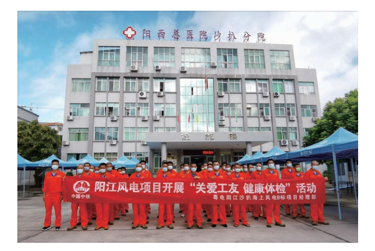
中铁大桥局为项目员工提供"关爱工友健康体检" China Railway Major Bridge Design Institute provides "Health Checkup to Show Love for Workers (关爱工友健康体检)" for employees under projects